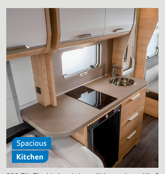
500 EU. The kitchen is incredibly spacious. All of the equipment is perfectly organised.

The specifications, dimensions, and appearance of the product as described are accurate as of May 2024. We reserve the right to make changes to the equipment, technical specifications, standard features, and prices. Minor variations in colour and texture may occur due to the nature of the materials used (e.g., slight colour differences of up to approximately 2.0 dE between metal and GRP/plastic paints) and are considered acceptable. Additionally, there might be slight discrepancies in colour between the images in this brochure and the actual vehicle due to printing limitations. Before purchasing, we advise getting detailed advice from an authorized dealer about the current model specifics. Note that some images may depict optional features that are not included in the standard package and may incur additional costs, or prototype features that are not available as options.