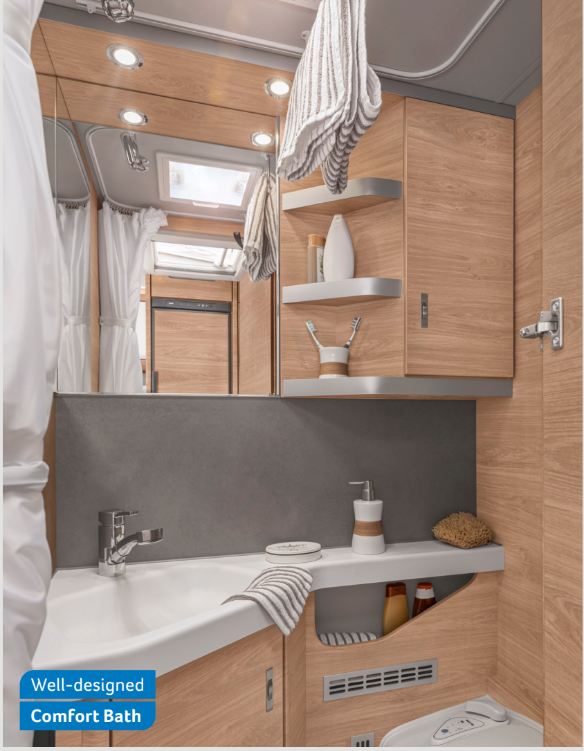
500 EU. Especially practical thanks to the perfectly integrated washbasin with extended shelf and bench toilet.