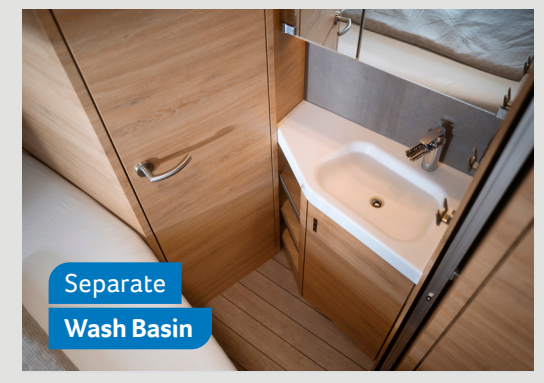
540 FDK. Here you have plenty of freedom of movement, a large washbasin and a separate shower.