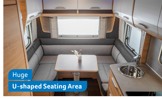
450 FU. Experience the ultimate in space and comfort with our expansive seating area, easily convertible into a cosy bed for added flexibility.