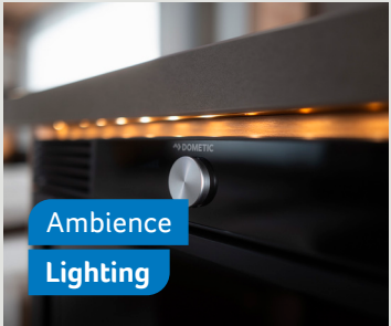
500 EU. Illuminate your journey with our LED ambient lighting, offering endless colour choices to match your mood.