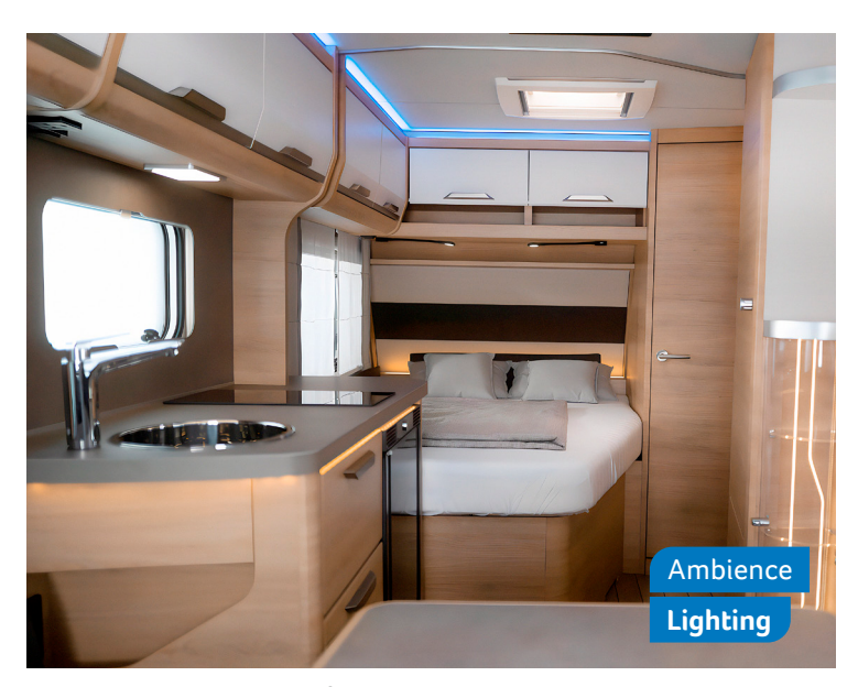
450 FU. Set the mood of your journey with customisable ambience lighting, transforming your space with every colour imaginable at the touch of a button.