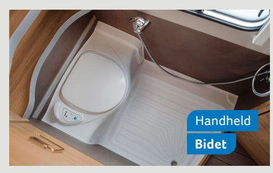
540 FDK. Experience the comfort of home with our integrated handheld bidet, designed for personal hygiene and comfort.