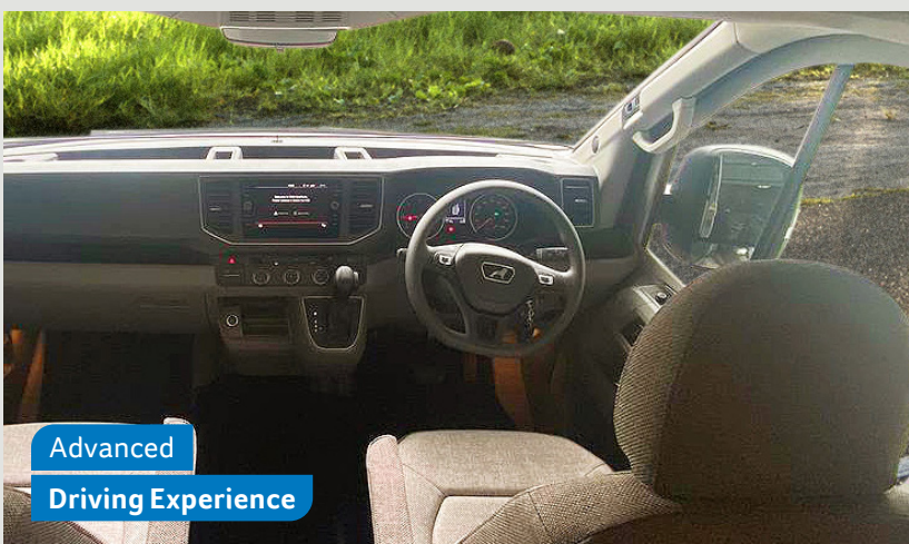
Advanced Driving Experience

An innovative refrigerator which can be opened from left and right side, allowing you to access it from inside or outside, optimising space and convenience.