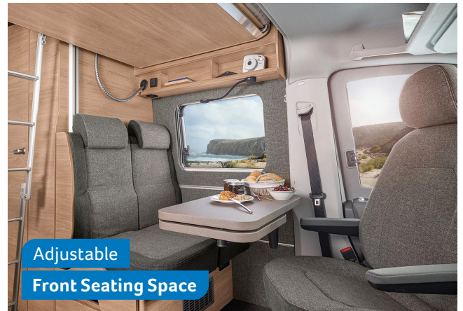
Adjustable Front Seating Space

Maximise comfort and space in your campervan with extendable plush seating that converts into a dining area, complete with a swivel table. Above, a retractable bed offers extra sleeping space without compromising daytime functionality. This blend of relaxation and practicality enhances your travel experience.