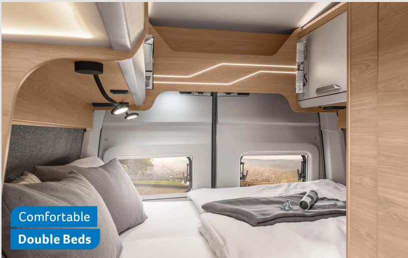
Comfortable Double Beds

Enjoy a cozy rear bed spanning the campervan's width, set in a warm wood decor and fabric-covered walls for a welcoming atmosphere. Equipped with integrated LED lighting, ample storage, USB ports, and reading lights for a comfortable, practical sleeping experience.