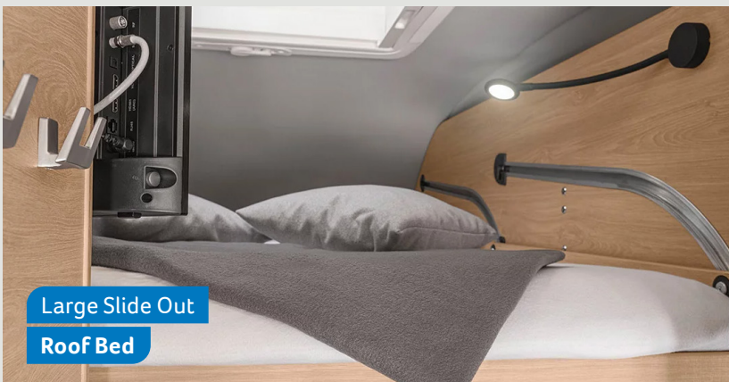
Large Slide Out Roof Bed

An immersive atmosphere with customisable RGB ambient lighting that also provides functional illumination, creating a welcoming and comfortable environment throughout your journey.