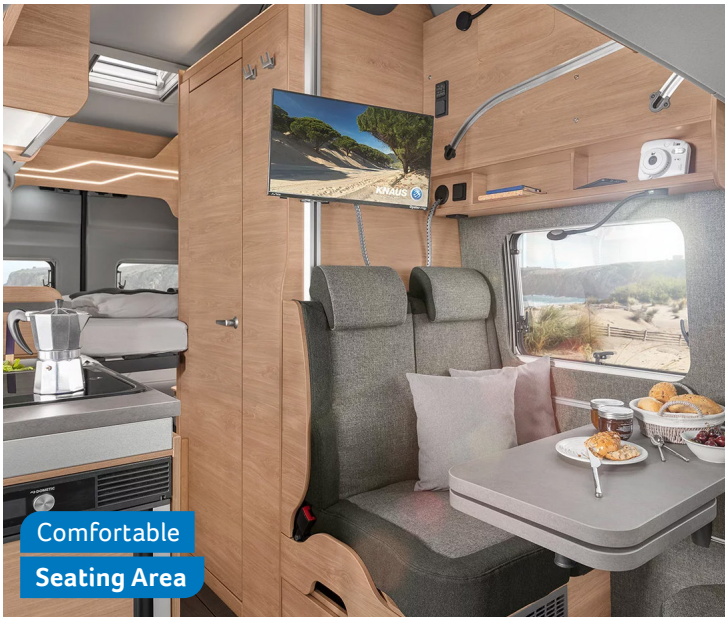
Comfortable Seating Area

Embrace the fusion of premium German engineering and local adaptability with the Knaus Boxdrive 600XL, built on the robust MAN TGE chassis and optional 4x4 All Wheel Drive. Our camper van not only promises unmatched quality and resilience suited for Malaysia's diverse terrains but also leads with its environmental stewardship. Equipped with advanced Euro 6d engines, it dramatically reduces CO2 emissions, offering you a cleaner, greener way to explore. Despite its compact design, the interior boasts a surprisingly spacious layout with dual sleeping areas, delivering supreme comfort for both families and adventurers. Revel in the luxury of a sustainable home on wheels, and experience the freedom to explore nature without leaving a trace.