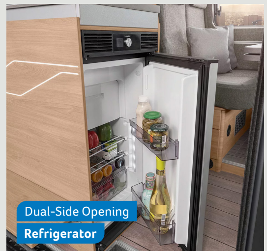
Dual-Side Opening Refrigerator

The high roof provides ample headroom and a spacious and open feel. The innovative slide-away bed features a star-gazer window and comfortably sleeps two, offering a cosy retreat during your travels.