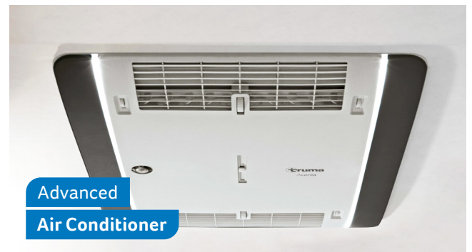
Advanced Air Conditioner

Versatile front seats easily rotate to allow comfortable dining or create a spacious lounge area for up to four people, blending comfort with convenience.