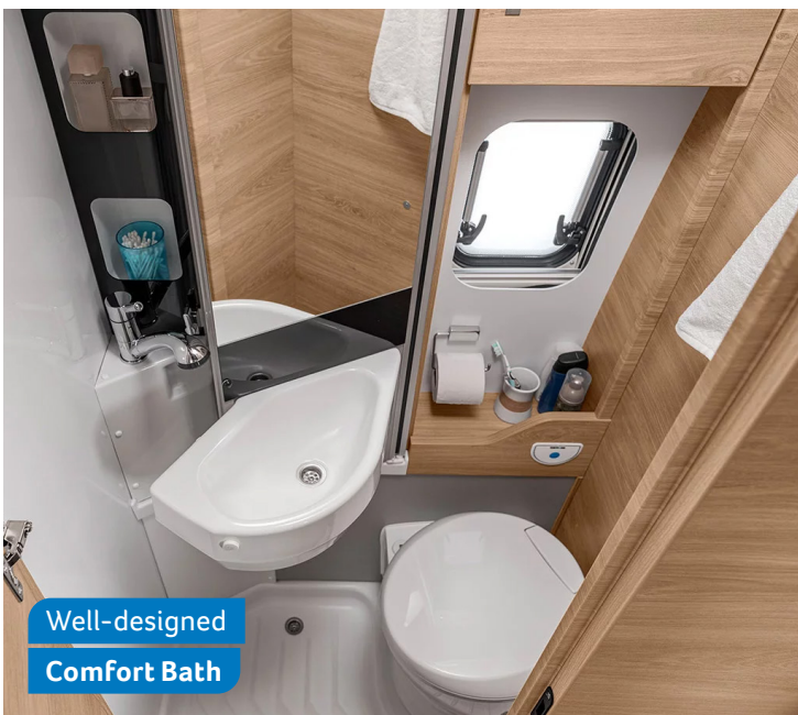
Well-designed Comfort Bath

The Truma Aventa Comfort Air Conditioner swiftly cools your vehicle to a pleasant temperature, while also purifying and dehumidifying the air to create an exceptionally comfortable indoor climate.